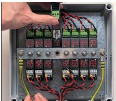
CME kits allow the simultaneous mounting and earthing of protectors through their central earth stud. Once installed, single protectors can be changed without removing others